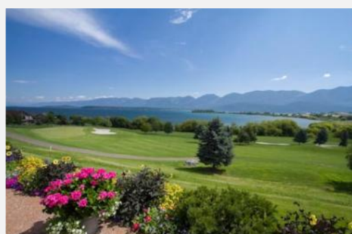
Beautiful Polson Bay Golf Course