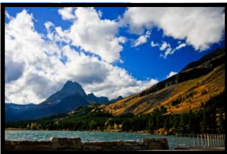
Glacier National Park's Many Glaciers