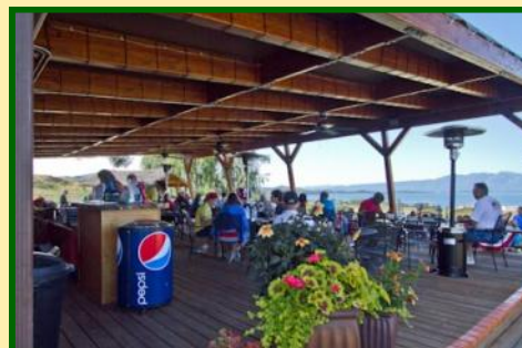
Lots of parties on our fabulous deck