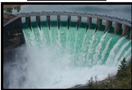
Kerr Dam in the Spring and Fall