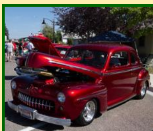
Antique Car Show