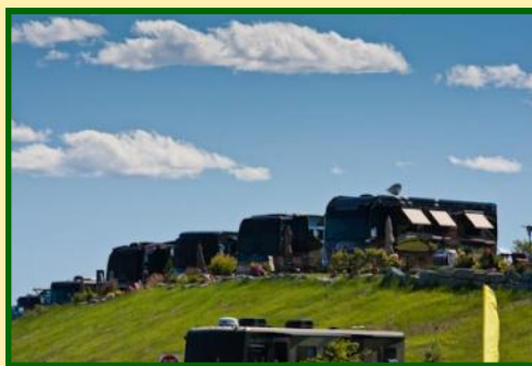
A familiar skyline in the Resort.