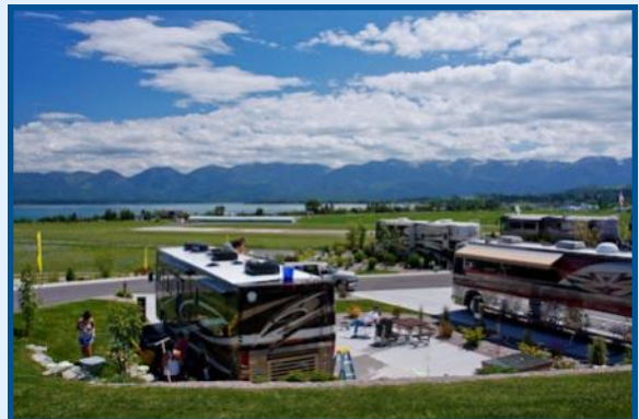
RV washing is available on-site by appointment.