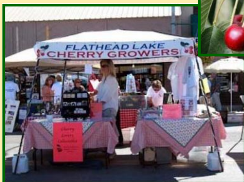
Main Street Cherry Festival