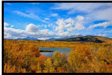
Glacier National Park's Fall Colors