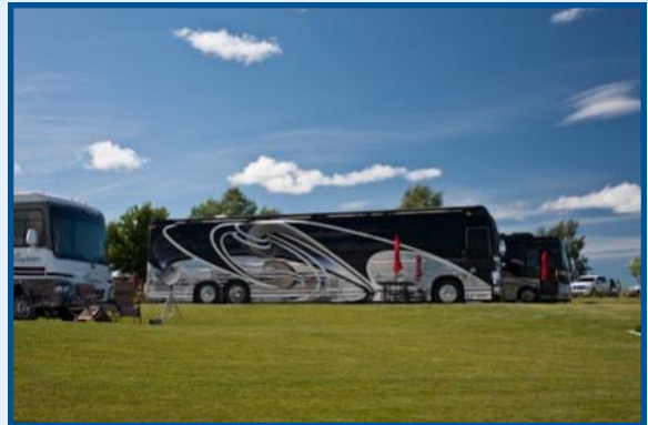
Spacious lots and common area for your enjoyment