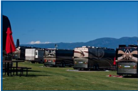
Prevost Rally in July.