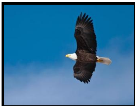
Bird watching is excellent.