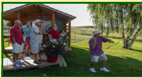
Olympics Opening Ceremony Party