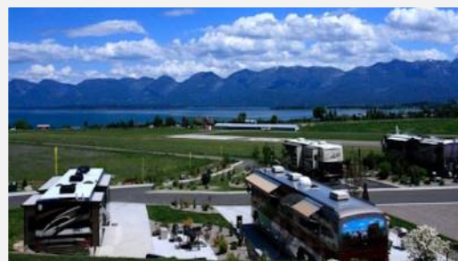
The best view in Montana!

It's not too early to make your reservations for next summer!