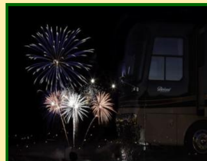
Best view for 4th of July!