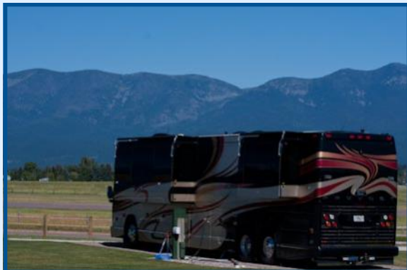
Every site has a spectacular mountain view.