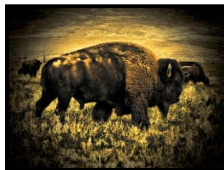
National Bison Range