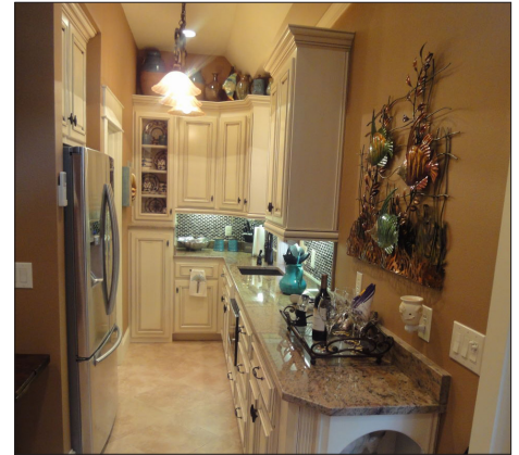
Gorgeous Kitchen w/ Large Stainless French Door Refrigerator!