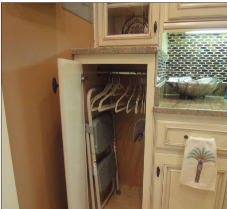
Convenient Hanging Closet Hidden in Kitchen Cabinets next to Bathroom!