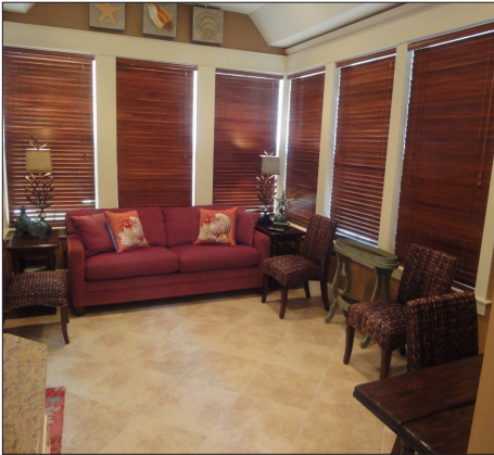
Nicely Furnished Spacious and Open Living Room with Great Garden Views!