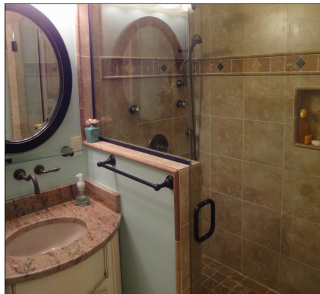
Designer Bathroom w/ Huge Tile Shower & Commode Tucked out of Site!