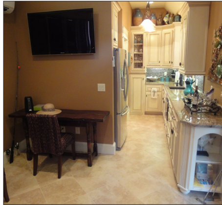
Big Screen TV and Room for a Desk or Dining Table!