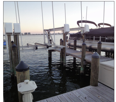
Includes Spectacular Boat Slip 136 in Private Marina w/ Lift Installed!