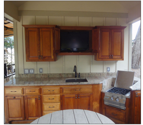
Loads of stunning Teak Cabinetry, Big Screen TV, and Extra Large Gas Burner!