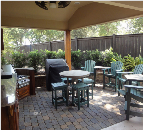
Roomy, Private, Fully Furnished Covered Patio!