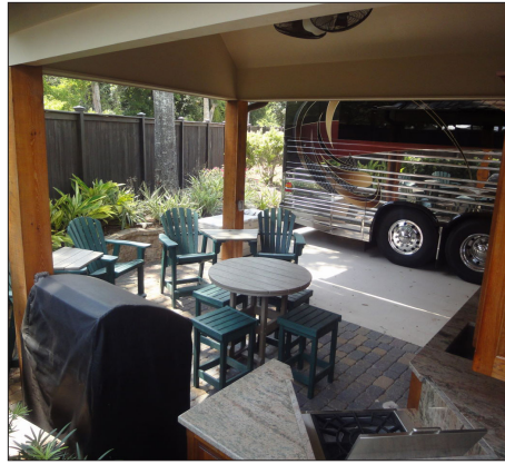
Beautiful Landscaping Surrounds the Private Patio Area!