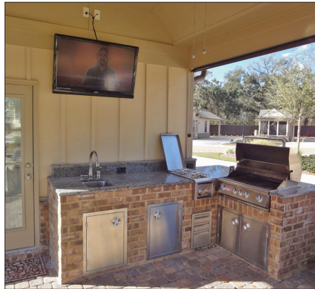
Entertain, cook, grill, tailgate... Enjoy! Convenient back door to Coach House!