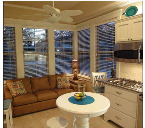
Tastefully and comfortably furnished including hide-a-bed sofa! Very open and light!