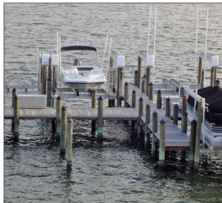
A large, protected boat slip 107 in our on-site private marina is included!