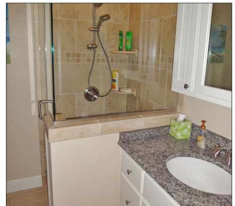
Roomy bathroom with designer touches and a large linen closet too!