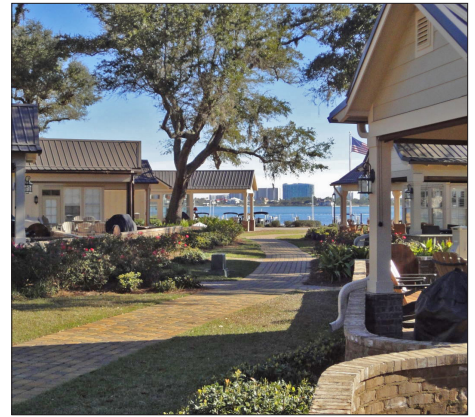
The water view from your patio is exceptional!