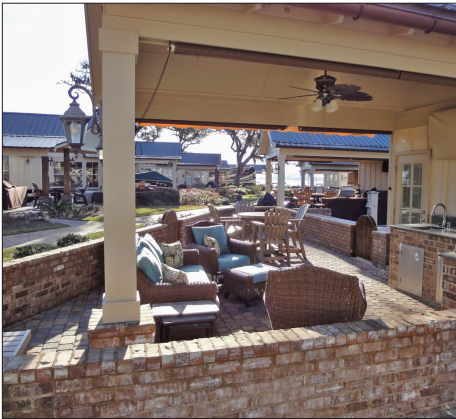
Huge fully furnished and walled puppy-friendly covered patio with power awning and much more!