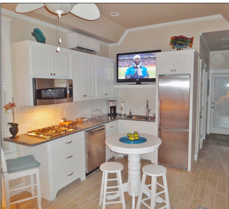
Awesome kitchen w/gas range, dishwasher, big screen TV, & extra door to patio!