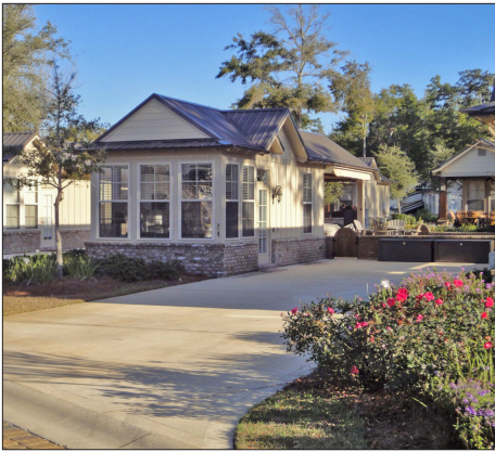
Beautiful Coach House & Landscaping welcome you home!