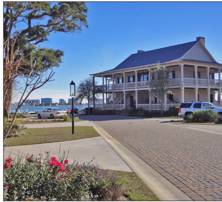
Enjoy the convenience of being close to the Club House, the Pool, the Fire Pit, the Marina and the great view!