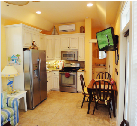
You will have it all with the complete kitchen, the adjustable big screen TV, & the dining table!