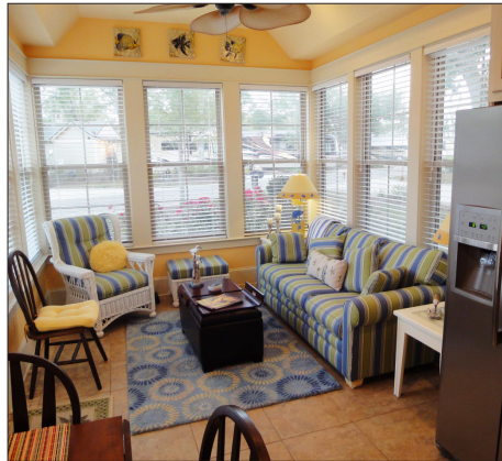
You will feel right at home with this nicely furnished light and bright living room with a tropical style ceiling fan and a hide-a-bed sofa!