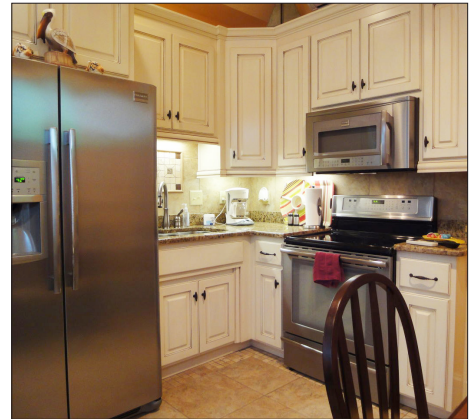
Enjoy your well-lit kitchen with custom cabinets, granite countertops, side-by-side refer with ice & water in door, full drop-in range, microwave, & more!