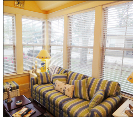
The stylish interior of your coach house is made better by the pleasant view of your yard!