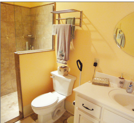
You will appreciate both the large tile shower and the big vanity in the roomy bathroom!