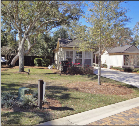
Not only do you have a lot of extra room for extra privacy, you also get to enjoy two beautiful and interesting trees!