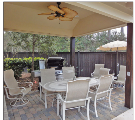
Your patio is ready to cook and entertain from the day you move in with a terrific natural gas Jenn-Air Barbeque included!