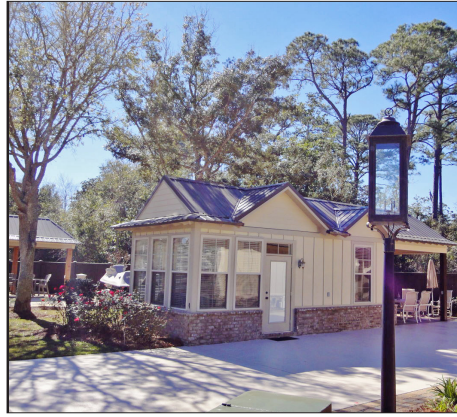
A stunning, yet restful, setting enhance by the natural gas lamp right in front!