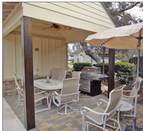
The patio is complete, comfortable, & private with great furniture and even an umbrella!