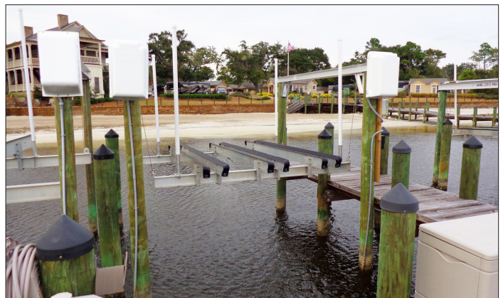
Enjoy unlimited boating from your slip #113 in our private marina!