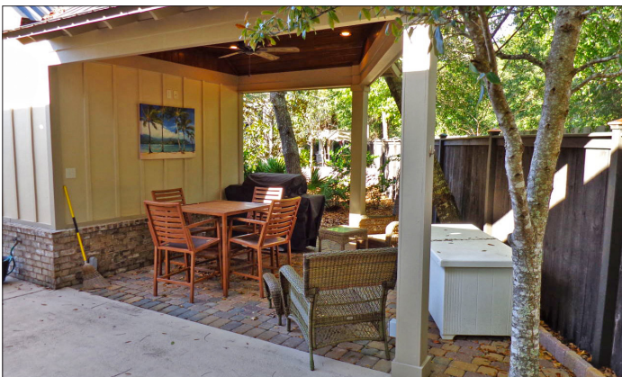
Barbecue and entertain on your very private covered paver patio!