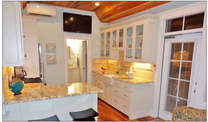
Enjoy the large convenient breakfast bar and abundant storage!