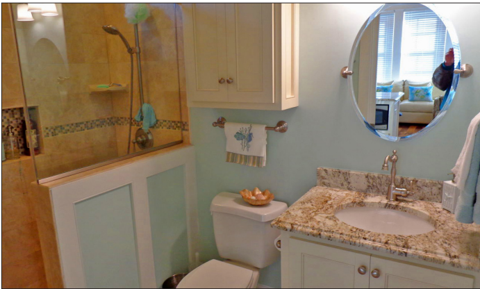
You will love the roomy bathroom with adjoining big closet!