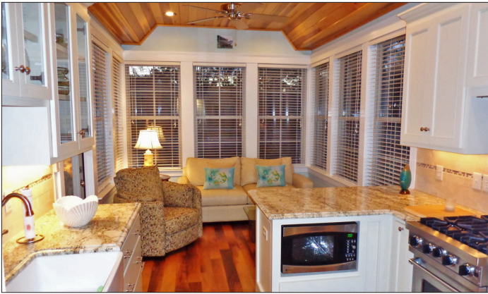
The roomy designer interior with fully equipped kitchen and vaulted ceilings!