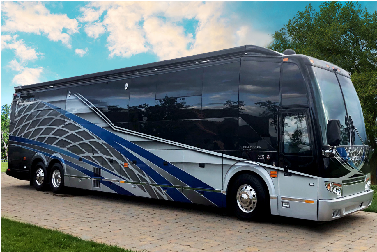
2020 Millennium H3-45 #763