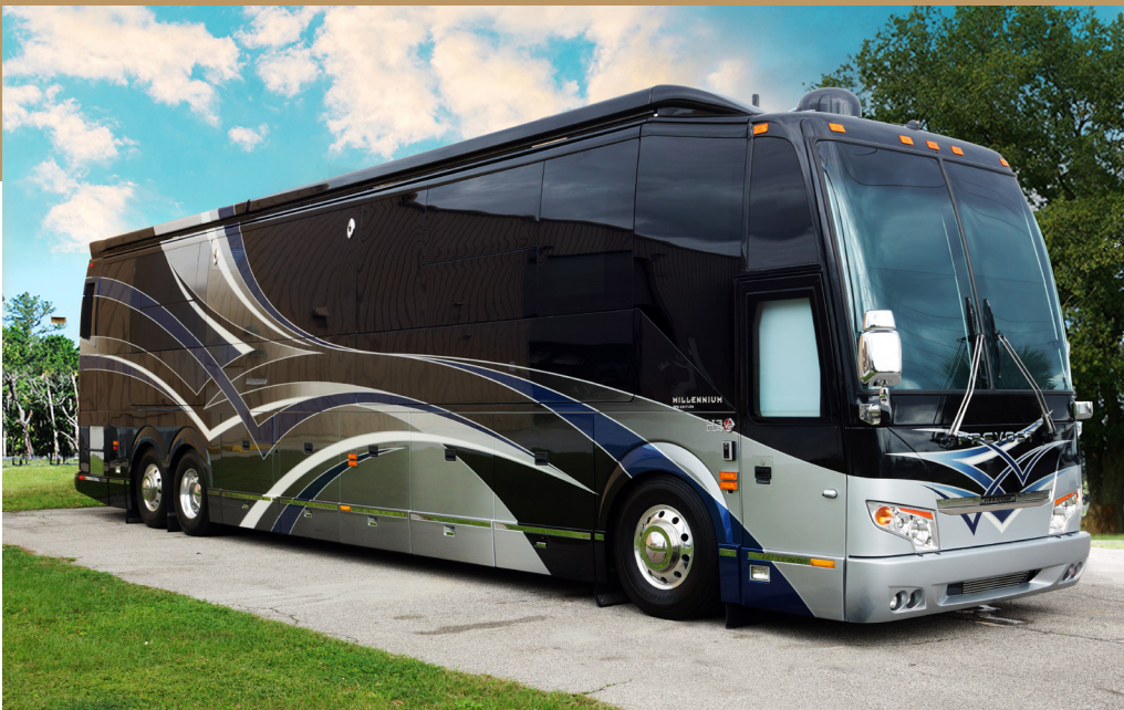
2015 Millennium H3-45 #758