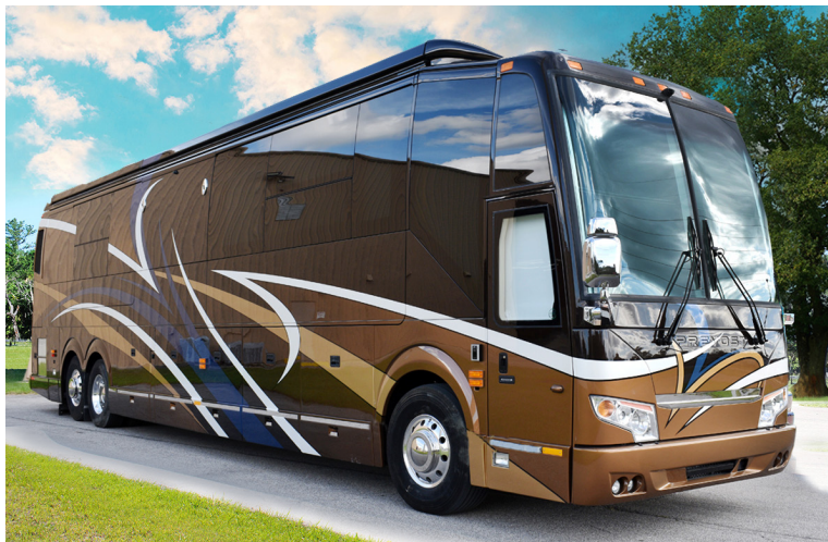
2019 Millennium H3-45 #761