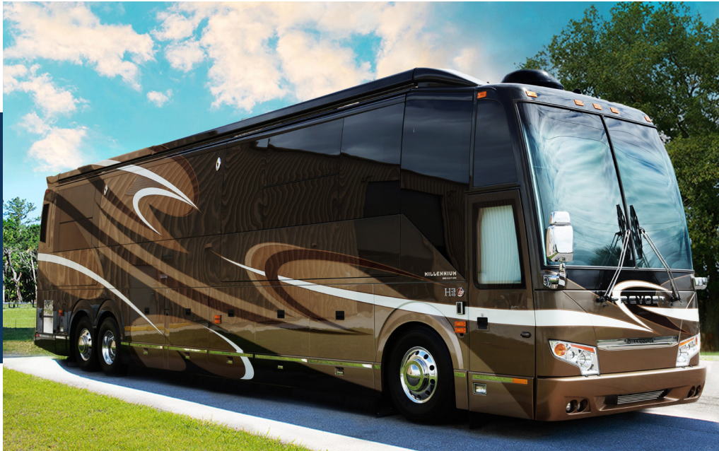
2015 Millennium H3-45 #750