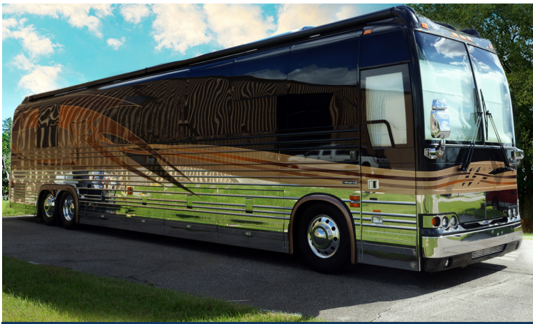
2008 Millennium XL2 #743