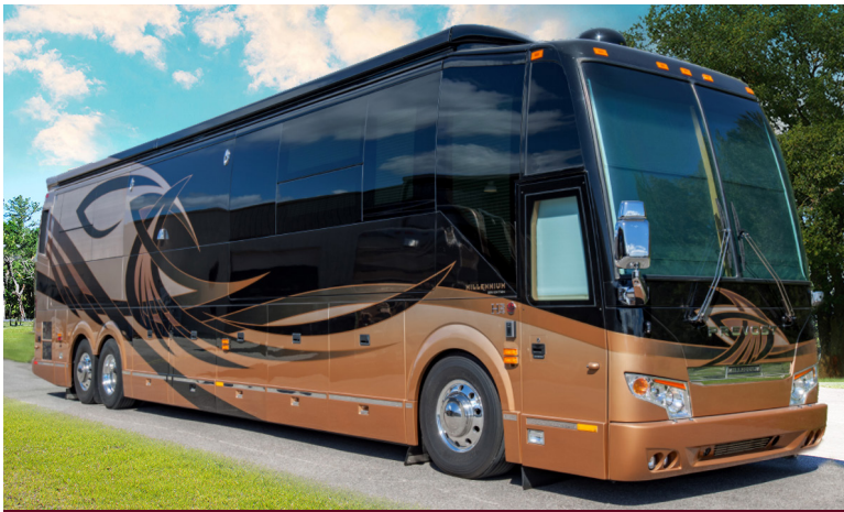
2014 Millennium H3-45 #718