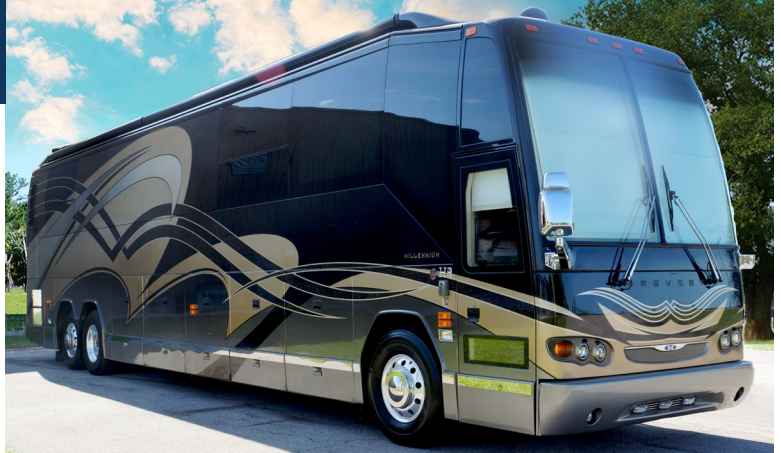
2009 Millennium H3-45 #757