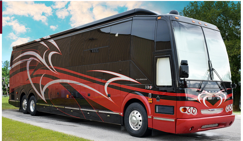
2010 Millennium H3-45 #735