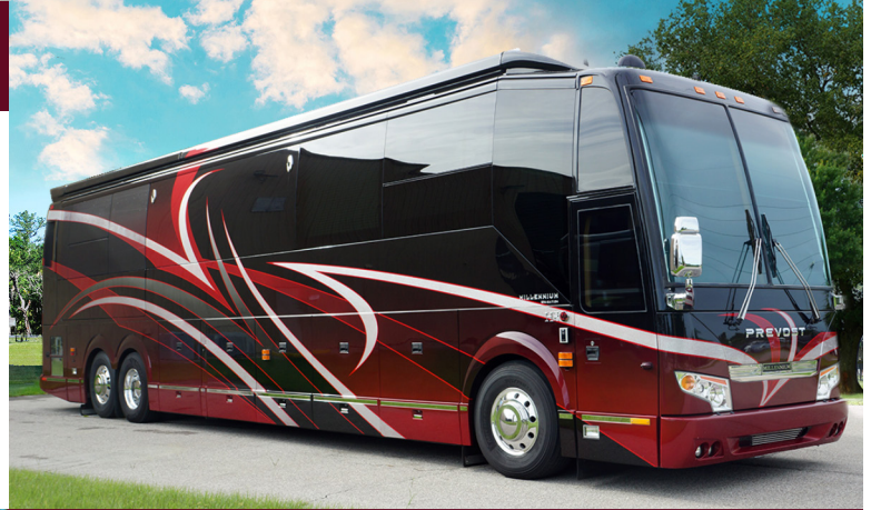
2014 Millennium H3-45 #741