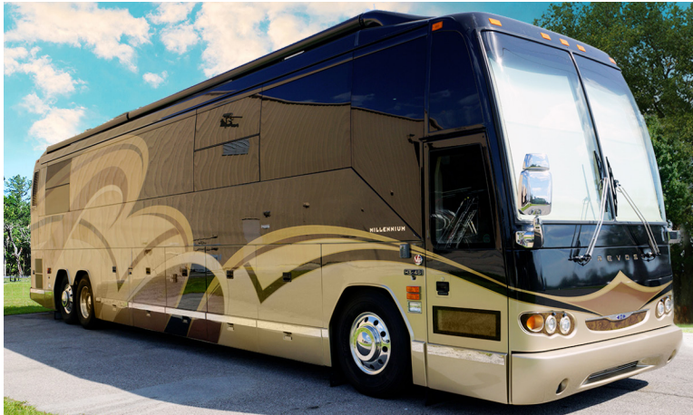
2008 Millennium H3-45 #728