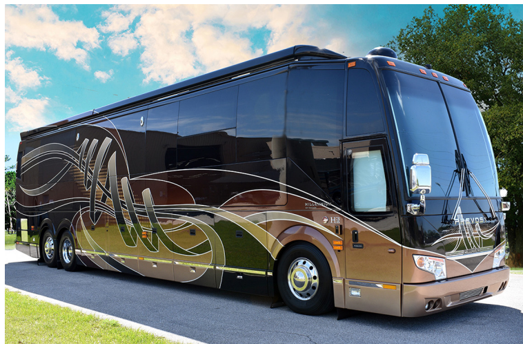
2017 Millennium H3-45 #3008