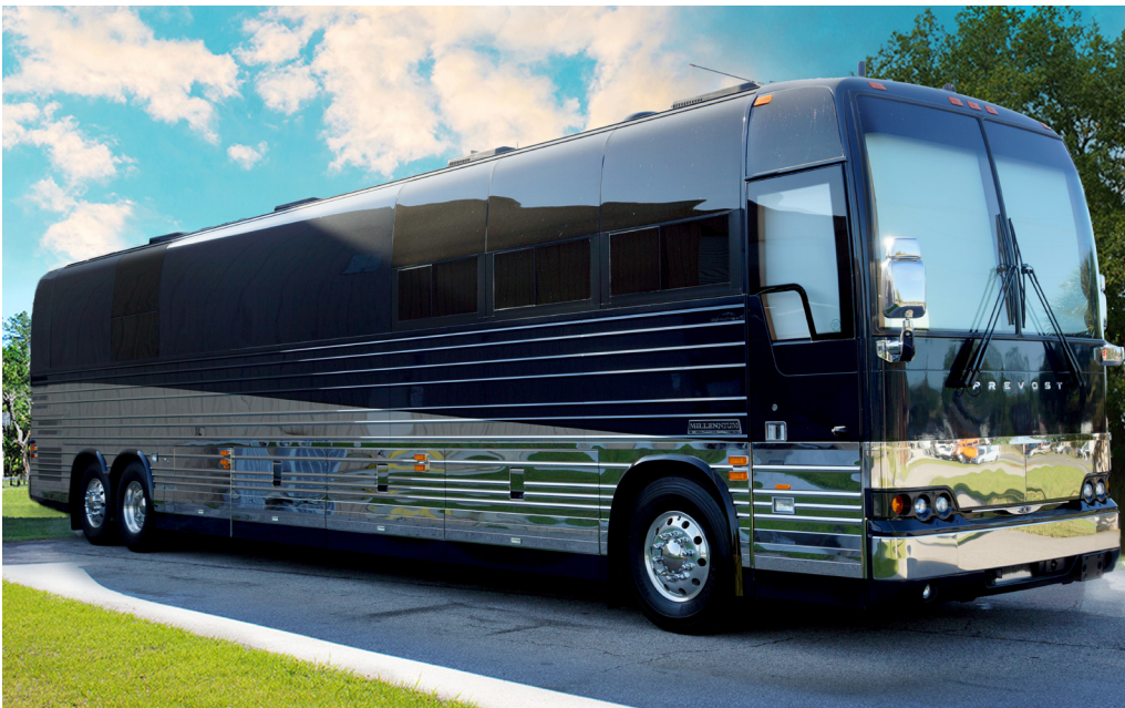
2015 Millennium X3 #754