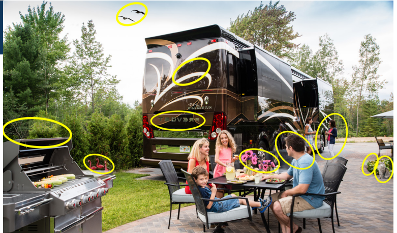
Answers: Spot the Difference