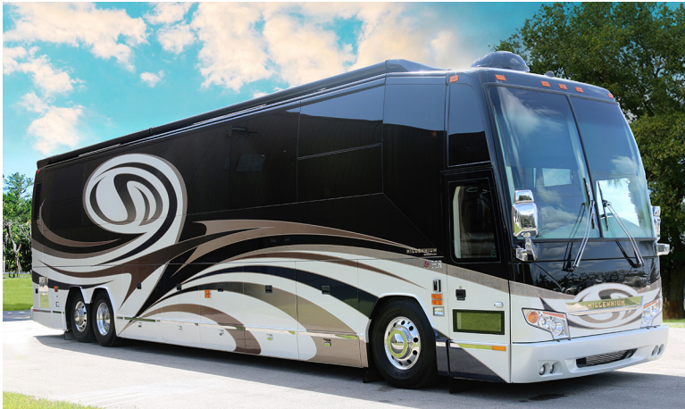
2012 Millennium H3-45 #755